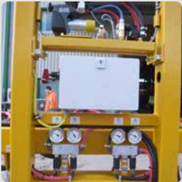
Quad circuit vacuum system with two pumps and four vacuum reserve tanks